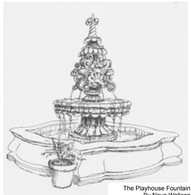
The Playhouse Fountain By Neva Wallace